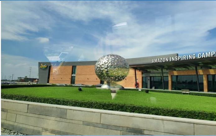
Figure 1: Amazon Inspiring Campus