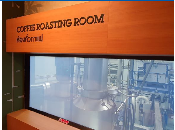
Figure 4: Coffee roasting room