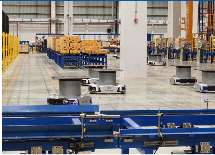
Figure 9: Logistics robot at the distribution centre