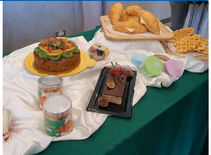
Figure 8: Attractive bakery products from OR