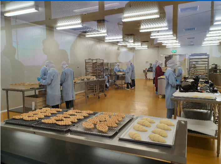
Figure 7: Bakery room with popular products