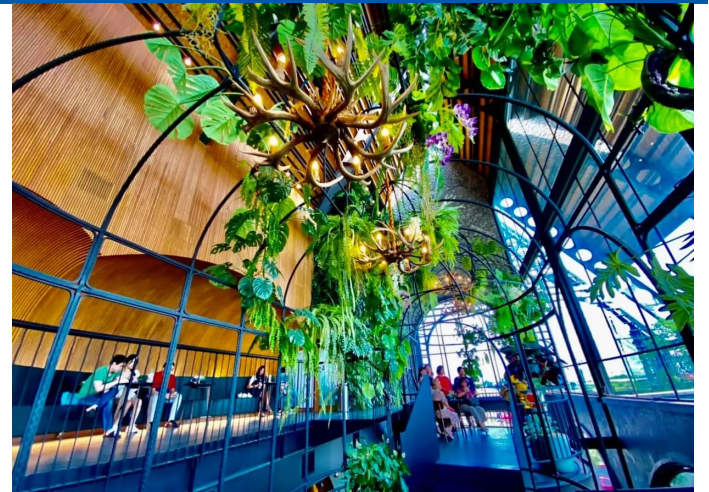
Figure 12: The Ayutthaya Café Amazon Concept Store blends architecture with nature