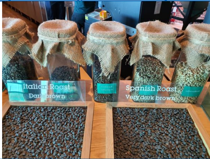
Figure 3: Favourable types of coffee for roasting