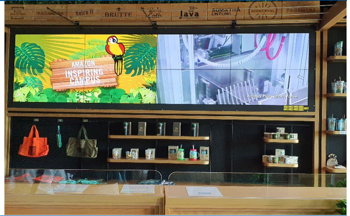
Figure 2: Monitor show within the Amazon Inspiring Campus