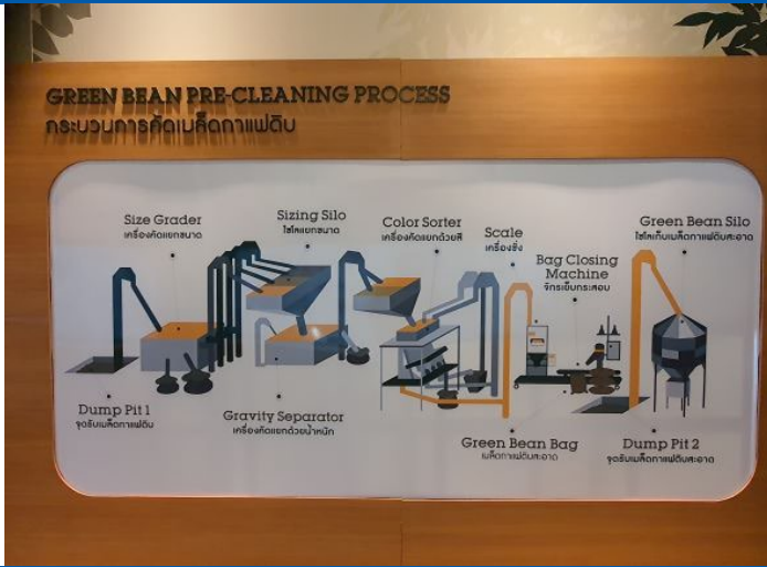
Figure 5: The high quality of the coffee-making process