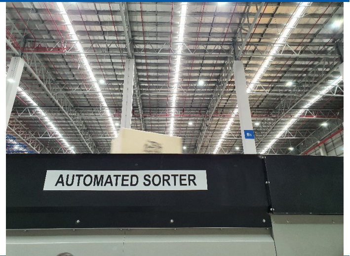
Figure 10: Automated sorter system at the distribution centre