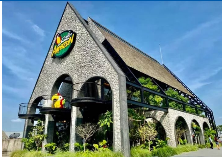
Figure 11: The Ayutthaya Café Amazon Concept Store, which mixes modernisation with local culture