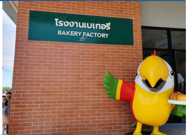
Figure 6: Bakery plant to serve OR's service chain